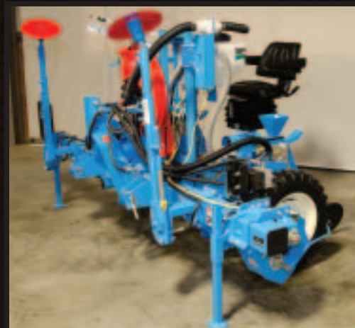
Shown with optional row markers.

Visit www.sresweb.com/runabout or scan the QR code for more details about the Runabout Planter.